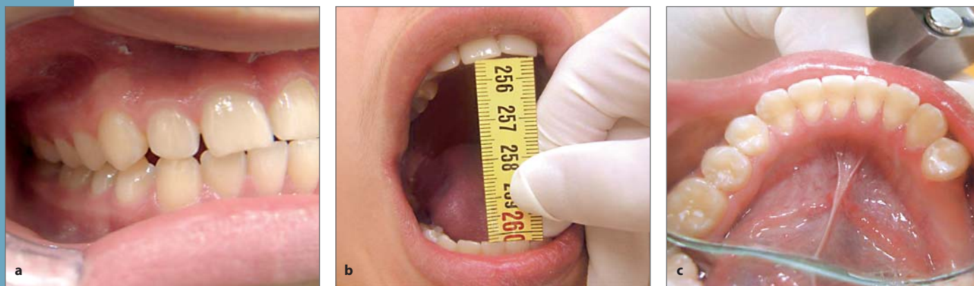
Figs 2a to 2c Oral status 27 weeks after irradiation therapy. (a) No plaque, gingivitis, recession, or cervical caries is evident. (b) No trismus is evident; 48-mm opening is demonstrated. (c) No caries foci are evident, and a normal bath of saliva in the floor of the mouth is seen.

During the radiation therapy, application of fluoride varnish was performed during weekly follow-up visits to prevent development of rampant caries. Oral examination for infection and mucosal integrity was done as well. Pilocarpine HCl, 5 mg tid, was initiated immediately after completion of radiation therapy. Because of poor compliance, pilocarpine was stopped after 1 month of administration and was readministered again 3 months later (Fig 1).